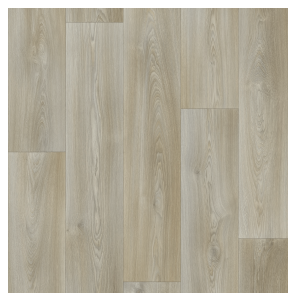
Columbian Oak 939L