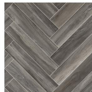
Venice Wood 969D