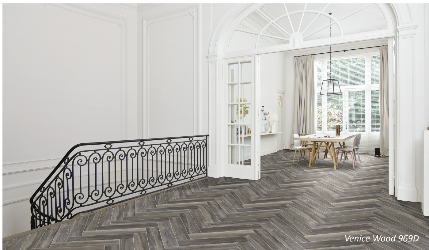
Venice Wood 969D