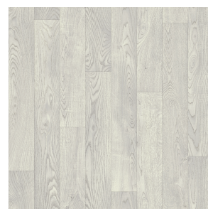
White Oak 979L