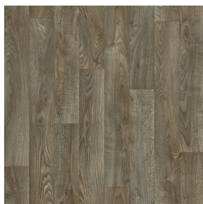
White Oak 997D