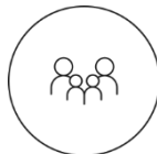
Great for families