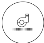
Castor wheel resistant