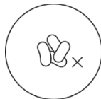
Bacteria and mould resistant