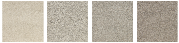
Antique White 401 Oatmeal 405 Shoreliner 407 Mushroom 408